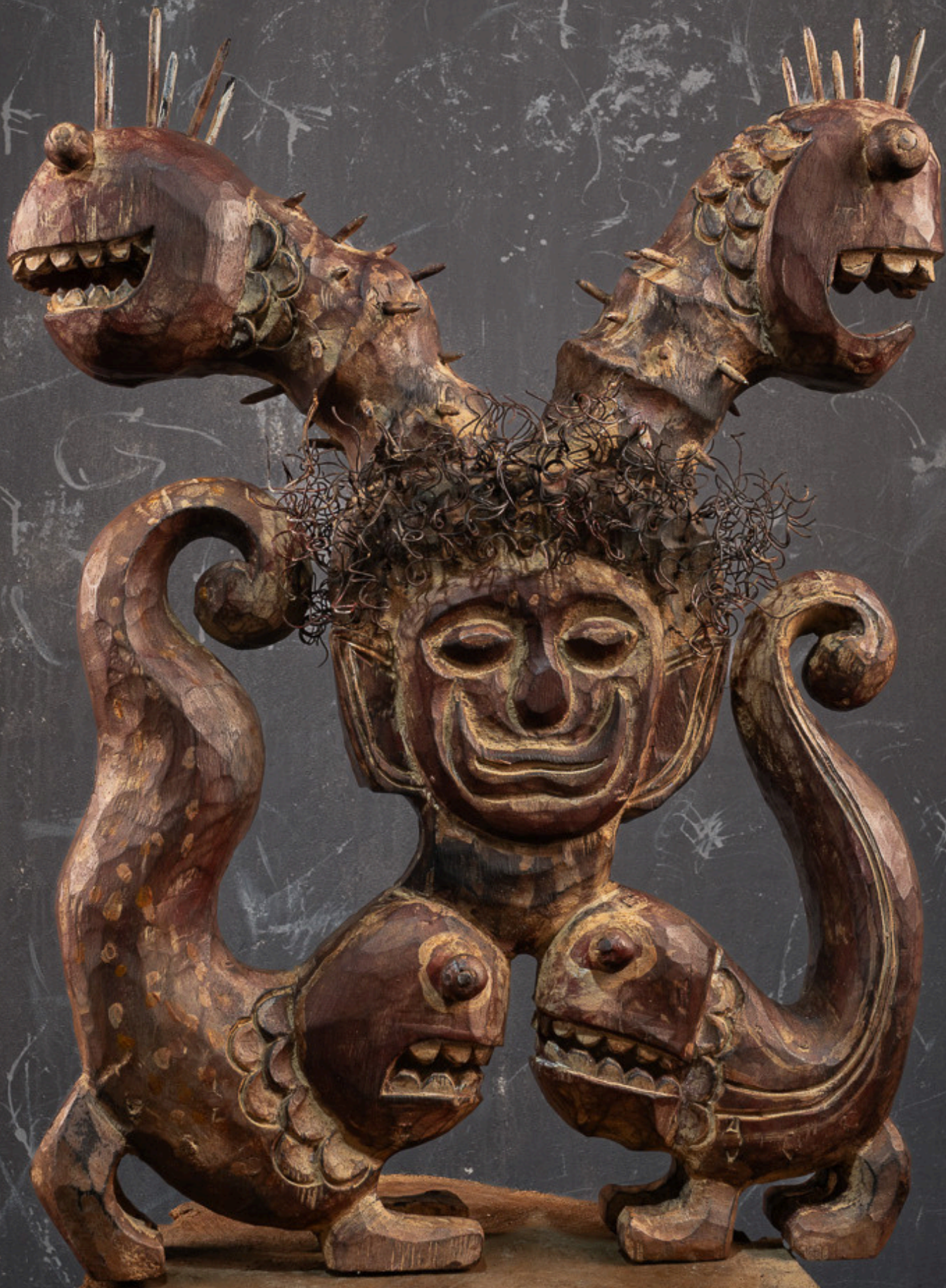
The Happy Centre, 2024. Indian Rosewood