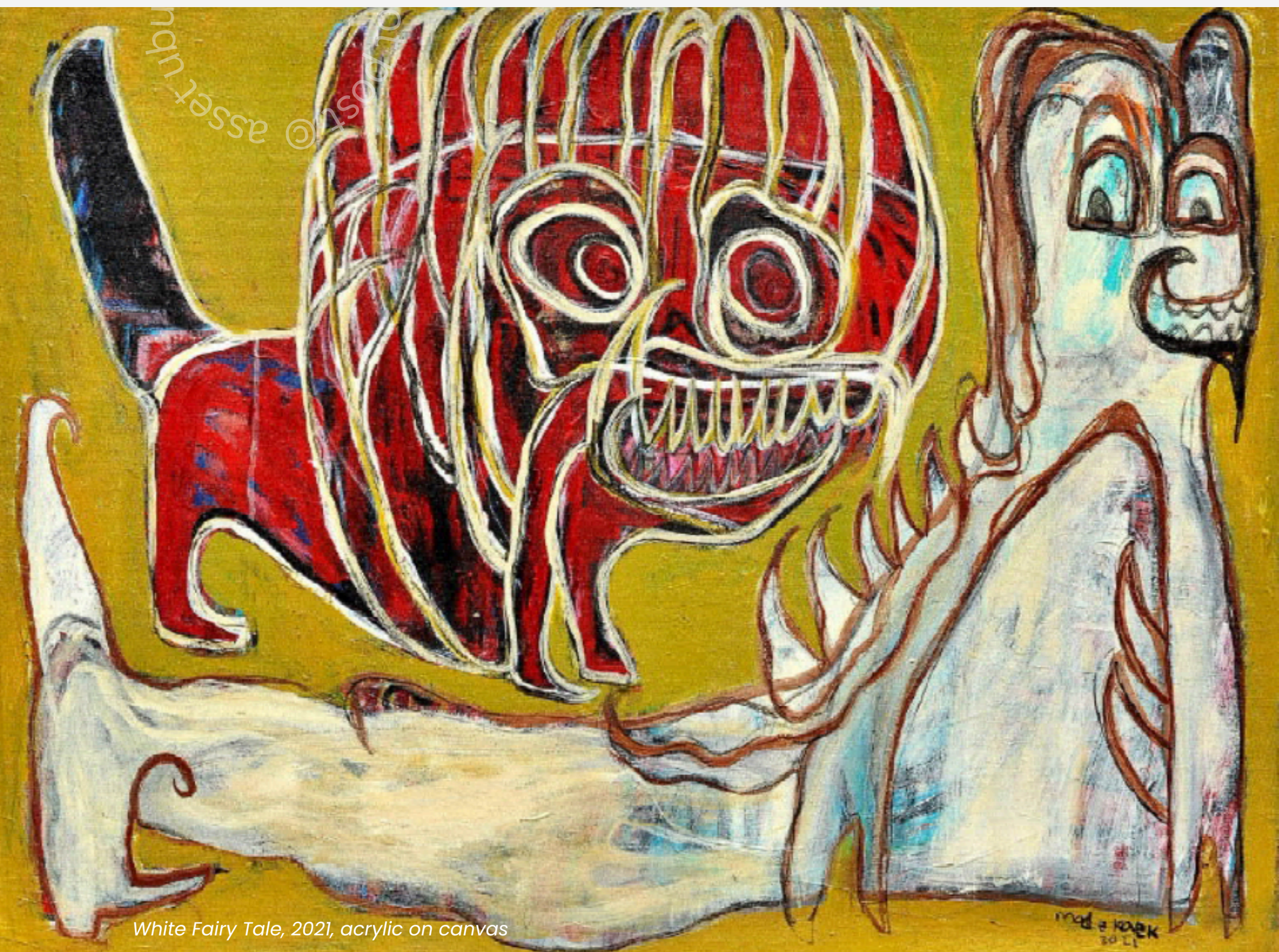
White Fairy Tale, 2021, acrylic on canvas

A shape or imagined being appears first—almost suddenly. Only afterward does meaning begin to grow. This process allows intuition to lead, rather than logic. For him, painting is a way of releasing subconscious pressure, translating inner sensations into visual language.