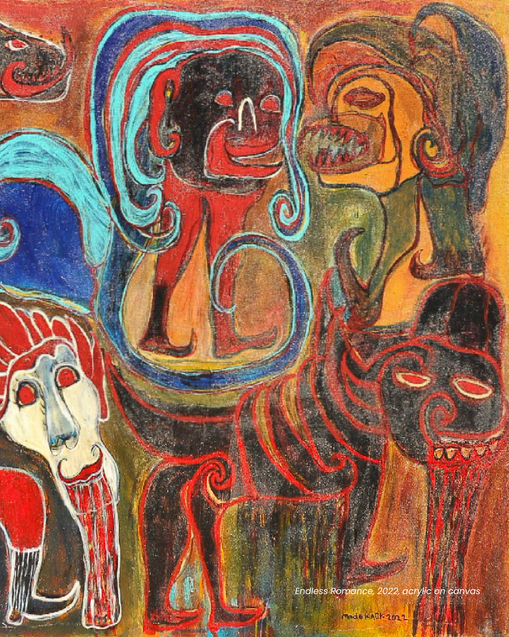
Endless Romance, 2022, acrylic on canvas